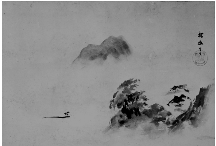
Misty Landscape , Kano School, early 19th century

Benchmark: VA.912.S.3.1 – Manipulate materials, techniques, and processes through practice and perseverance to create a desired result in two- and/or three-dimensional artworks.