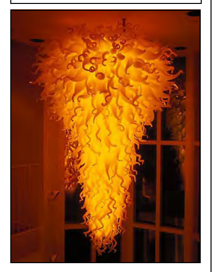
Figure 4: Dale Chihuly, Chandelier , glass