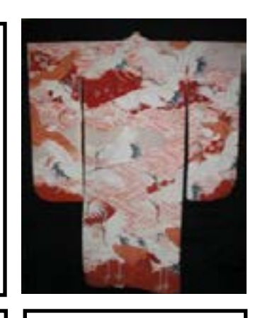
VOCABULARY Furisode – The most formal kimono style, it has long sleeves, and is worn by unmarried Japanese women. Kimono – A traditional

Kimono, meaning "thing to wear," is a traditional garment worn in Japan. As a universal symbol of Japan, the kimono refers to the eternity and endurance of traditional beauty. With a thousand years plus history, the kimono is still worn by people in Japan for special occasions such as tea ceremonies, festivals, or weddings. Among the different types of kimonos, the furisode, with almost floor-length "swinging sleeves," is the one most often associated with Japan. Young adult women wear furisodes until they get married.